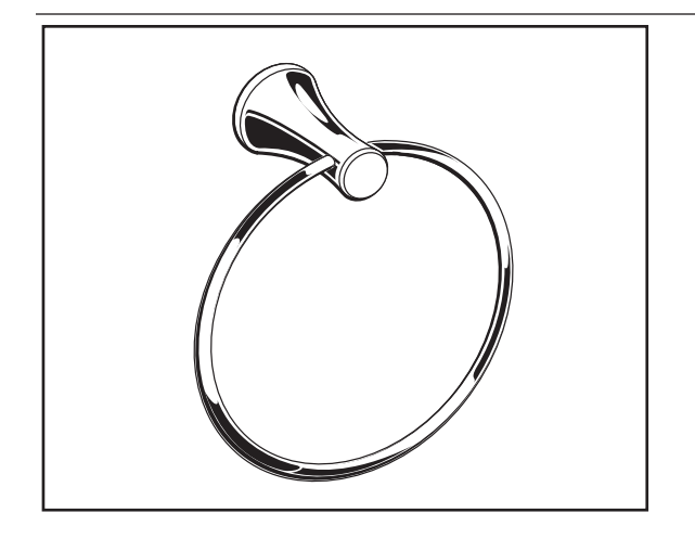
Style That Works Better